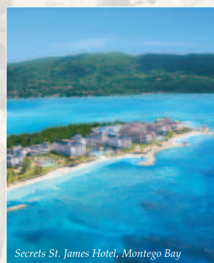
Secrets St. James Hotel, Montego Bay